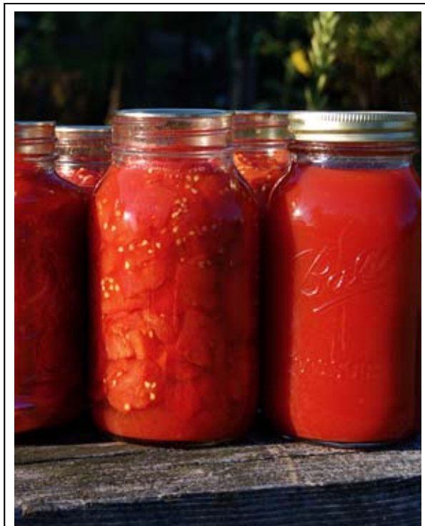
salsa di pomodoro