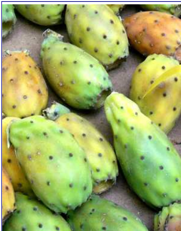
fico d ' india